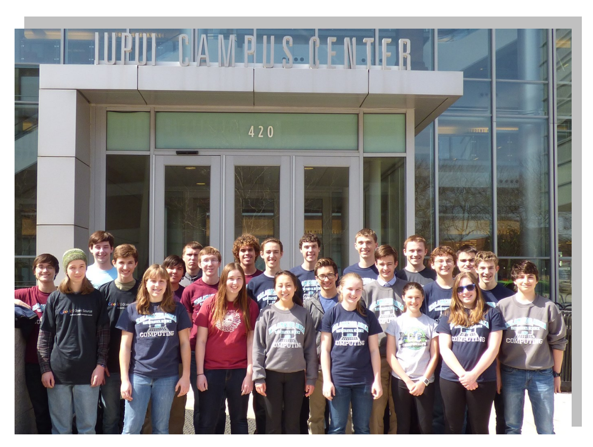
Indiana-Purdue IUPUI Team Computer Science 1st, 2nd, 3rd Place--24 Students Game Programming 1st Place