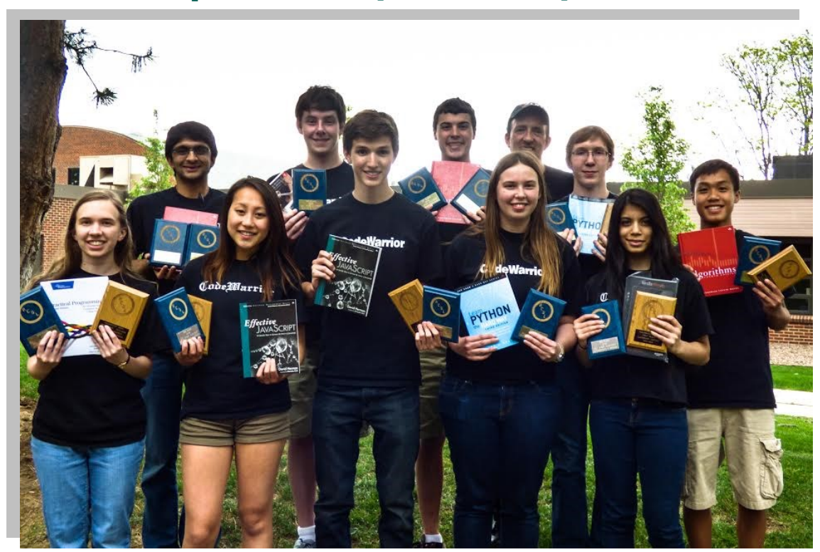
American Computer Science League ACSL All-Star International Team Denver, CO--May 24

To read more, please visit: http://www.mlive.com/news/kalamazoo/index.ssf/2014/06/kamsc_atyp_students_win_honors.html